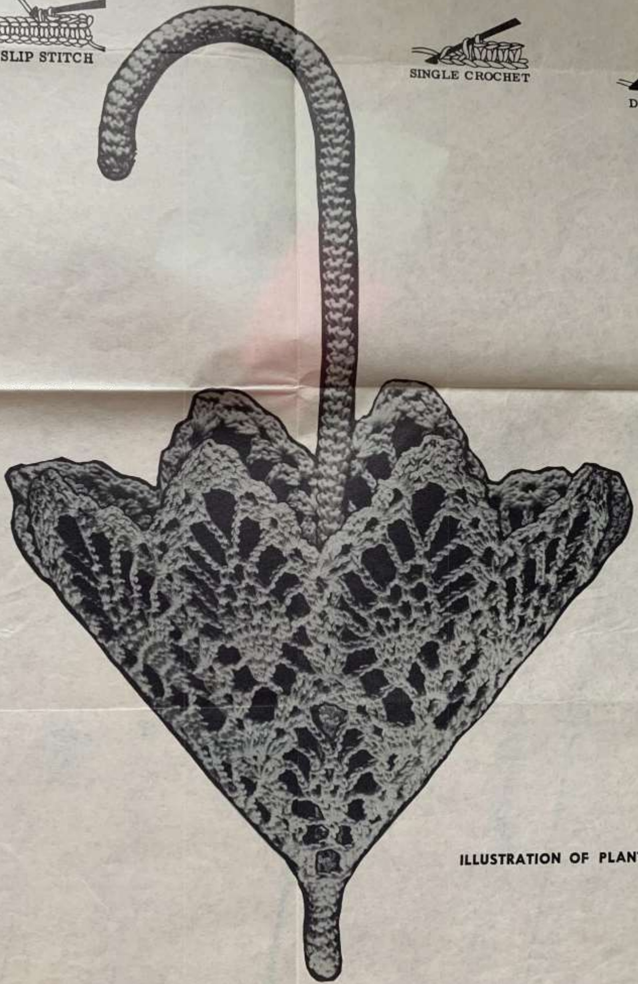
ILLUSTRATION OF PLANTER